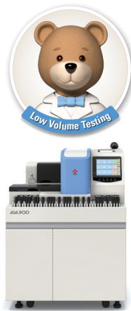
AIA-900 Loader Model