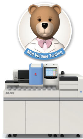
AIA-900 with 9 Tray Sorter