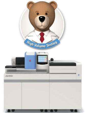
AIA-900 with 19 Tray Sorter

The latest addition to Tosoh's family of AIA immunoassay analyzers is available in three configurations, allowing you to choose a system that's just right for your laboratory workload.